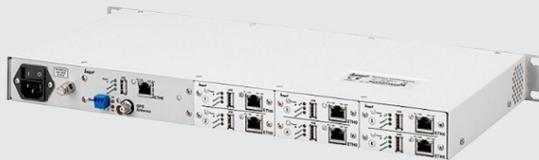
rear view 8029HEPTA DataCenter with a total of 7 mutually independent NTP time server

We would be glad to forward an individual offer to you! Please fill in the inquiry form on the last page and send it to info@hopf.com .