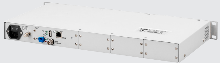
rear view 8029HEPTA DataCenter with 1 Ethernet-interface, 1 USB-port and status-LEDs