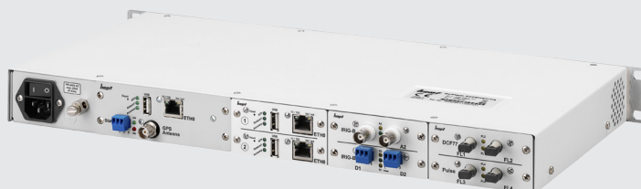
rear view 8029HEPTA Industry with 3 mutually independent NTP time server, 2 x IRIG-B analogue (BNC connector), 2 x IRIG-B digital (connector block) as well as 2 x DCF77 pulse and 2 x cyclic pulses (fiber optic in each case)

example 2: 8029HEPTA in its most flexible way: