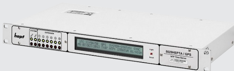
front view 8029HEPTA DataCenter with display and status-LEDs

Please let us know your requirements – we would be glad to forward an individual offer to you!